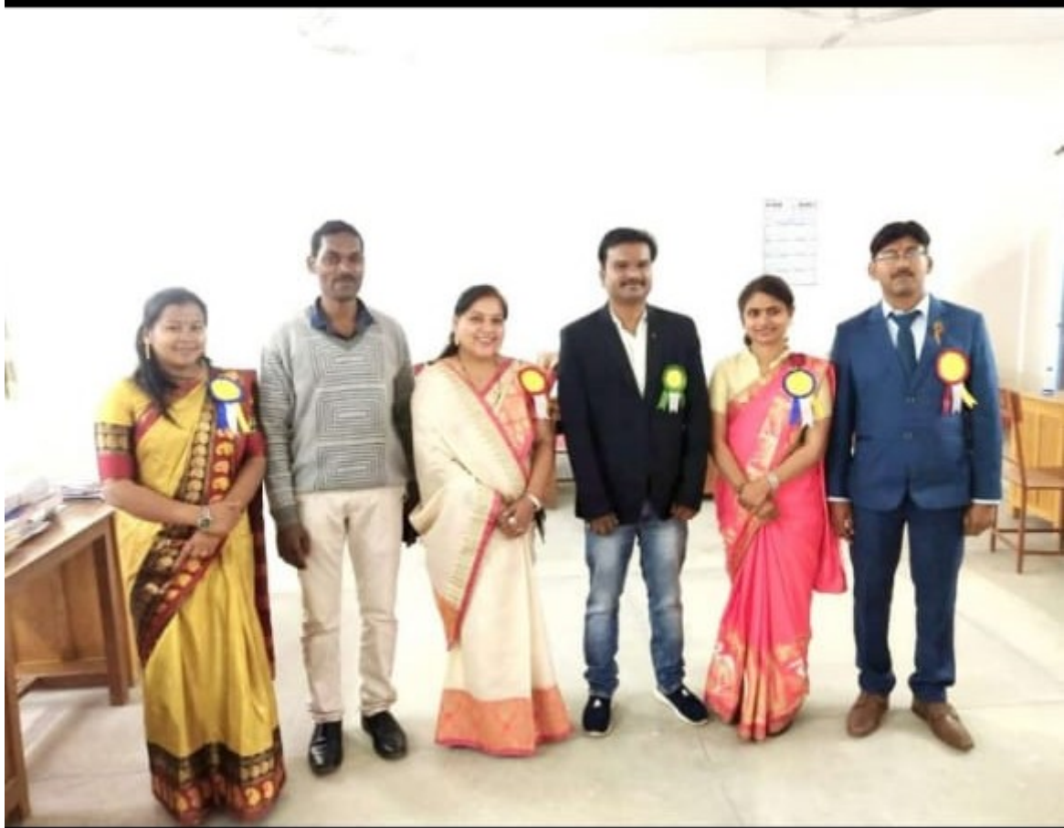
Computer Staff Members