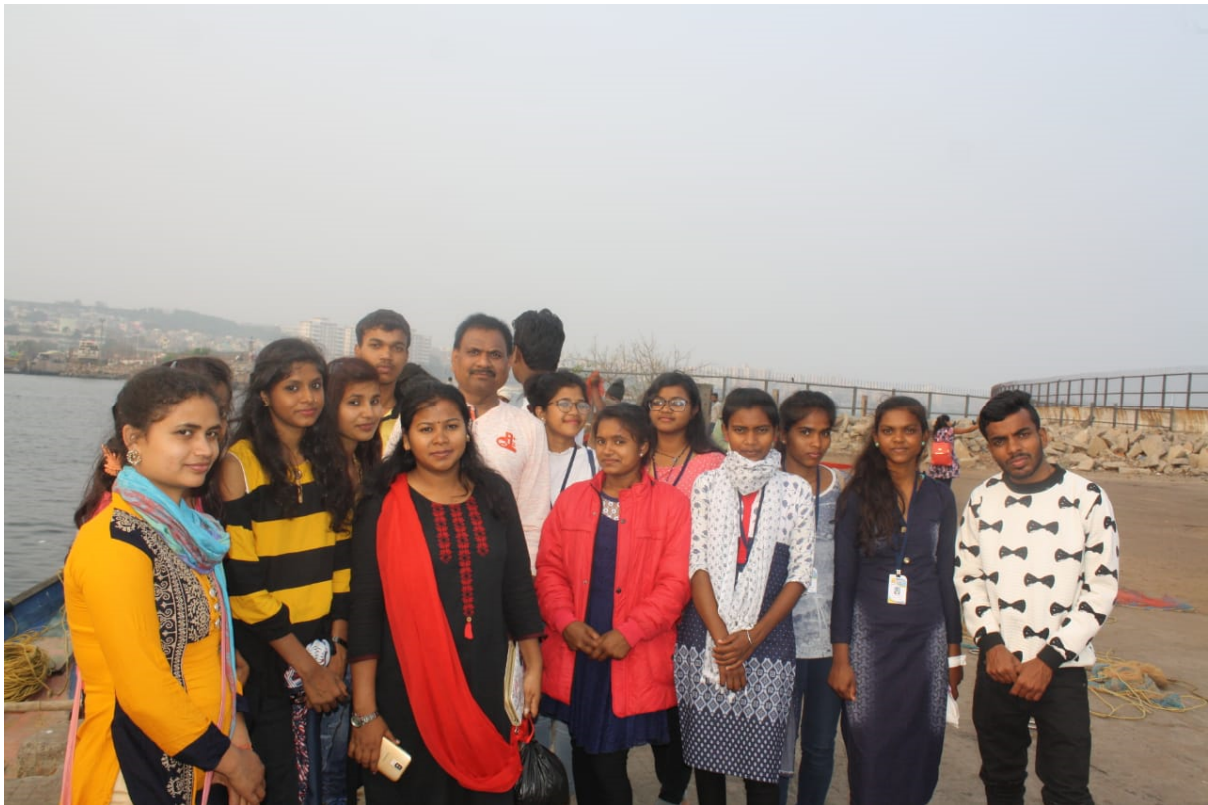
Educational tour to Vizag, visiting Andhra University and Shipping area in 2018-19.