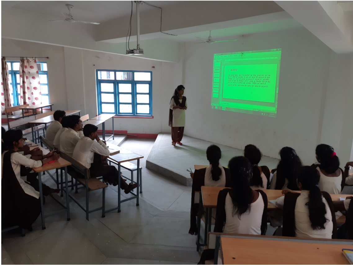
STUDENTTS PRESENTING SEMINARS (B.C.A.)