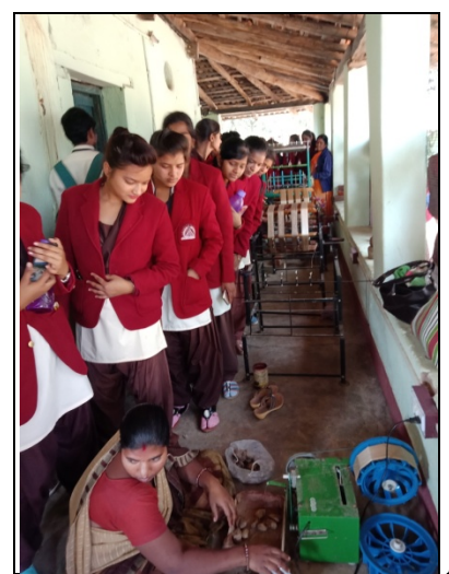
Environment Educational trip "Sericulture Department", Kunkuri