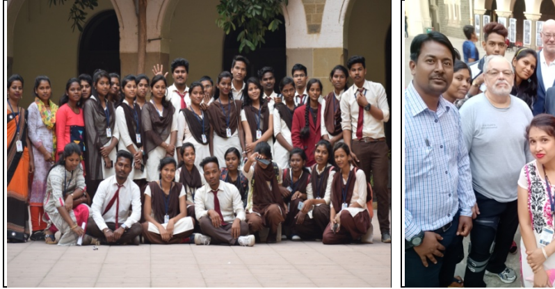
Mumbai Educational Trip "St. Xavier College"