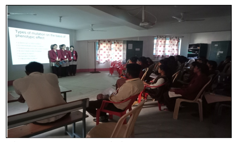
Students giving seminar with their power point presentation